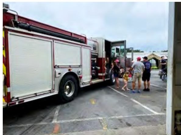
The kids enjoyed their craft projects with Home Depot. Can't beat a fire engine for that wow factor! Kids loved it.