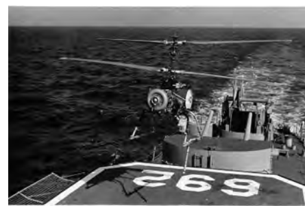
Bottom Right: A QH-50C hovers over the destroyer USS Allen M. Sumner (DD-692) during a deployment to the Mediterranean Sea in 1969.