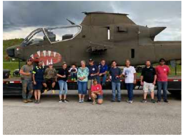
Preparing for the parade! What a great crew!