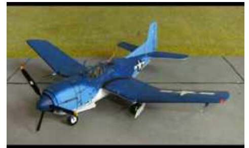
Future Paint Scheme for the BTD-1