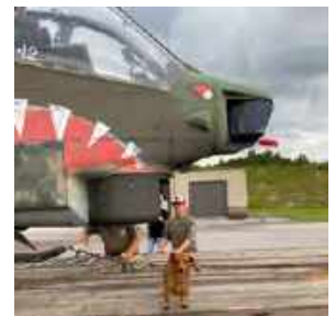
Quimby is ready for the Parade.

Office: 1824 E. Crabtree Road, Hixson, TN 37343