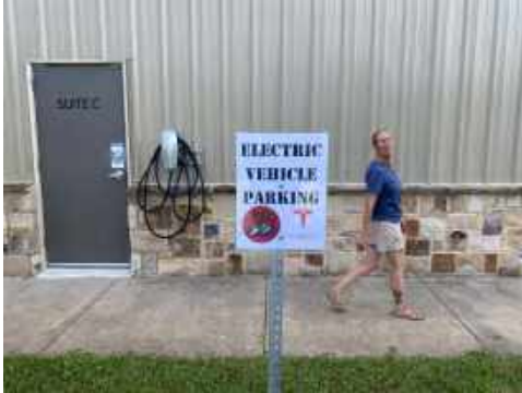
The museum now has new signs for the electric vehicle parking.