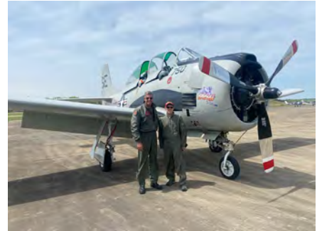
Bjorn Nelson flies the T-28