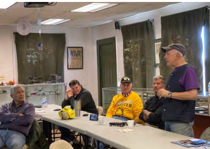
All Pilots Meeting