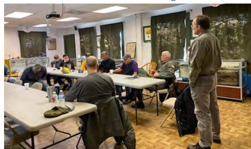
All Pilots Meeting