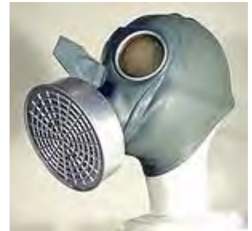
VM37 Gas Mask

This mask was made in various sizes, for children, women, men and oversized. The eye lenses are made of clear cellulose eye pieces and have discolored over time to yellow. Some eyepieces have been known to turn red over time. The protruding piece at the top between the eyes is a “flutter valve” for exhaling. While wearing the mask, the valve makes a fluttering sound. It has a rubbered inhale valve and a foam ring that helped dry the intake piece from moisture and condensation.