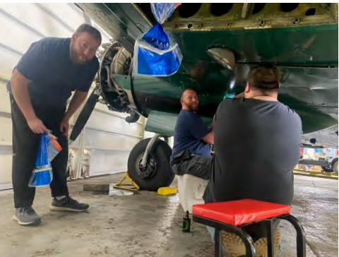
Servicing, cleaning, and lubricating the C45 for its annual inspection.