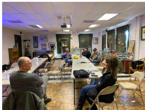
All Pilots Meeting