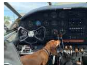
Quimby in the C-45