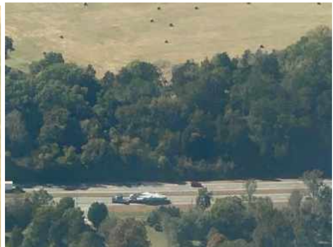
Some amazing aerial shots of the F-14 on Hwy 27 make this transport extra special.