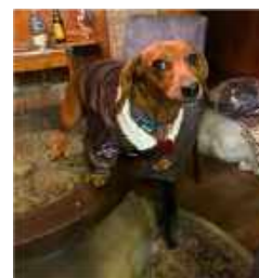
Quimby dressed to fly!