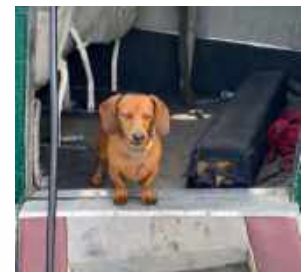
Quimby Inspecting the C-45