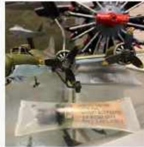
$150 Donation, Sparkplug

The engraved brick will become part of our museum courtyard for all to see. Your choice of customization.