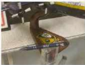
$20 Donation, MOF Pen

Now, we know...it's just a pen but we are impressed with it! It is comfortable to hold, can be used as a stylus, and has a long life.