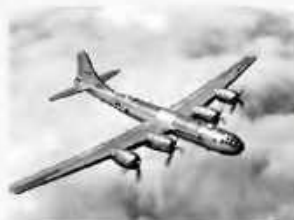
$50 Donation, B-29 Print

This pocket tool with keyring, customized for the museum could be the perfect item for you or a family member.