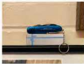
$20 Donation, MultiTool

Now, we know...it's just a pen but we are impressed with it! It is comfortable to hold, can be used as a stylus, and has a long life.