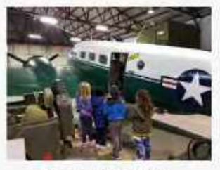
$1000 Donation, C-45 Wing

Normally, $500, this price is a bargain! Become a Life Member and enjoy the great perks of unlimited access during museum hours, a museum patch, and more!