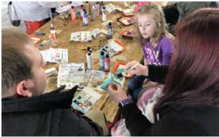
The Home Depot children's station was a hit.