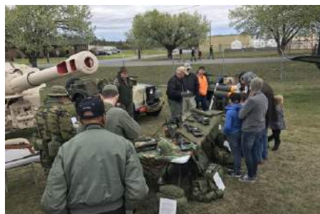
Vietnam reenactors under the museums captured an Iraqis soviet 152 Howitzer that would have been used by the NVA.