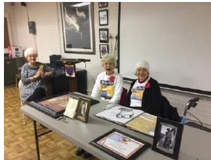
Rosie The Riveters are all smiles at their booth.