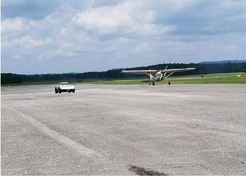
Above: Thrust vs torque demonstration.