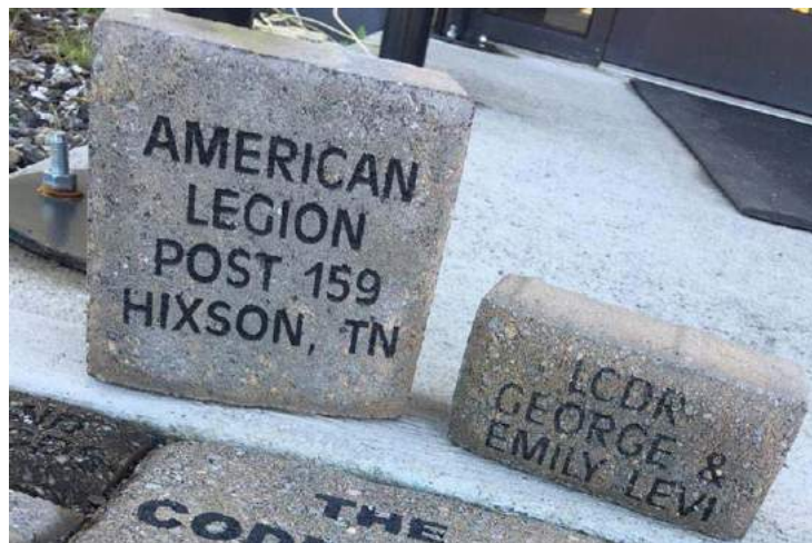
Call 423-800-3455 to reserve your paver today!