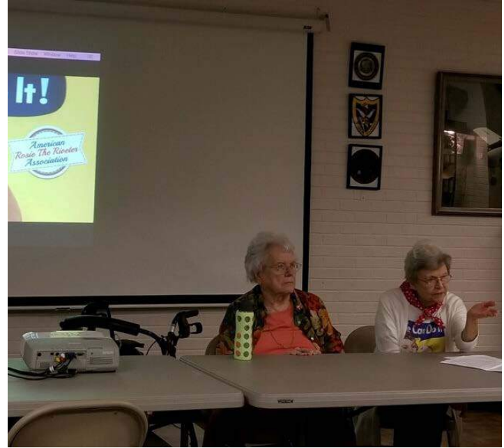
Above: The Rosie the Riveters' presentation.