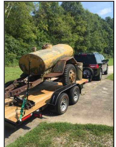
(Above) A 1943 USMC Water Buffalo used in WWII and Korea is on its way home to Rome, GA from Expeditionary Airfields.