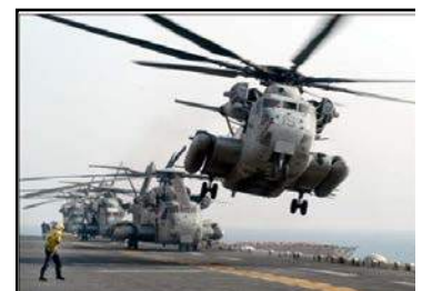
Marine CH-53 Helicopters – Shipboard Ops