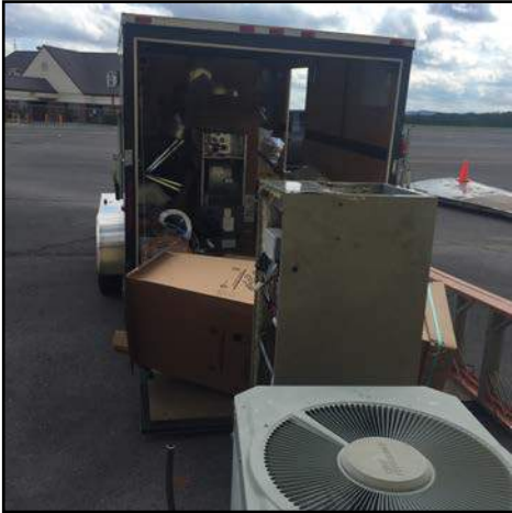
Museum members Randy and Jarrod Hitchcock replace the old HVAC units in the hangar. We are elated to have new AC – especially during all this hot weather!