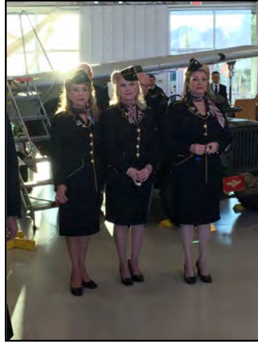
The Ladies of Liberty