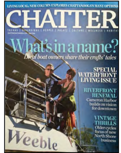
Chattanooga's magazine, Chatter, featured the Open Hangar Gala.