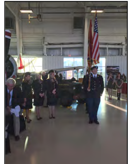
UTC ROTC Color Guard