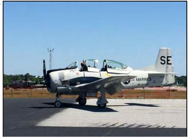
Pilot Pete “Wheeler” O’Hare waves for the camera.

The museum offered cockpit tours and a display of a variety of ammunition and other items used during the Vietnam War. Thunder in the Valley was great opportunity to share the museum’s love of aviation history with a variety of air show attendees. All who attended had a great weekend.