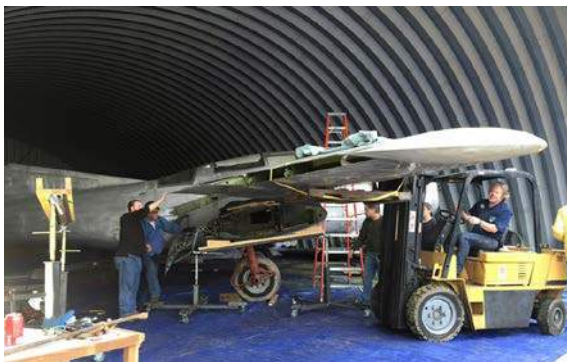
Wing Dock Day!