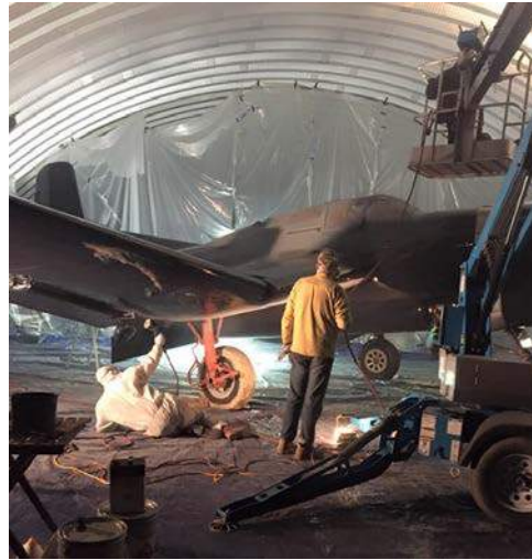
Volunteers applying the primer

The work was extensive, moving the airplane to the hut, re-installing the wings, the many hours of prep work and then the primer and paint. Kudos to the many volunteers that helped with this job!