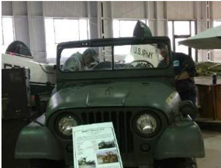
While the T-28's were getting their conditional inspections, the Jeep got some attention as well.

Each Saturday for the first few months of the year is called the "Safety & Maintenance Stand Down". The annual maintenance is done on the aircraft, training is offered to volunteers in a variety of topics and often, lunch is served.