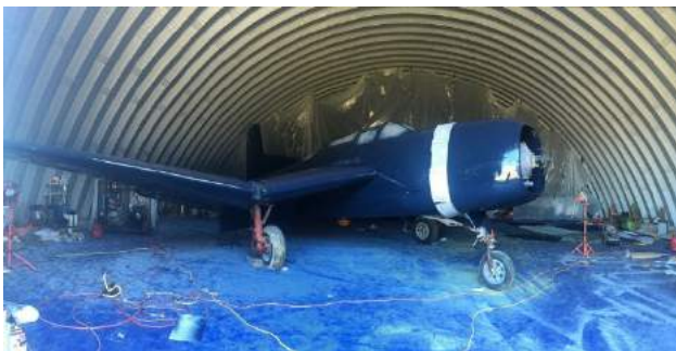
BTD-1 with new paint