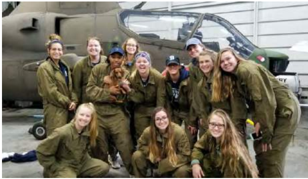
The Berry College Girl Softball team gets some volunteer time at the hangar.