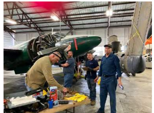
Annual aircraft inspection