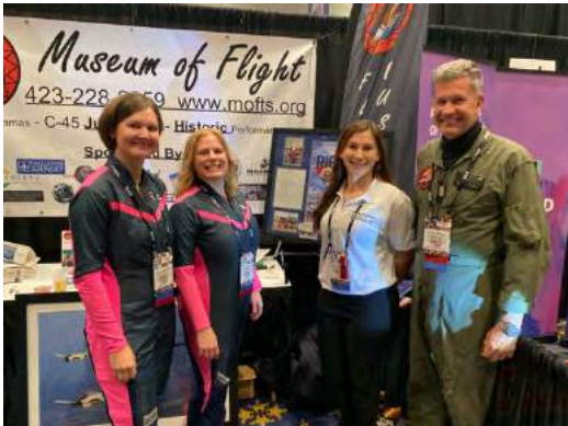
The Misty Blues Jump Team who jumped from the C-45, visit our booth.