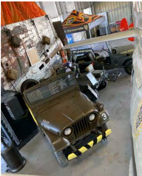
The winter vehicle display, and ammo can Christmas tree were featured during the holiday season.