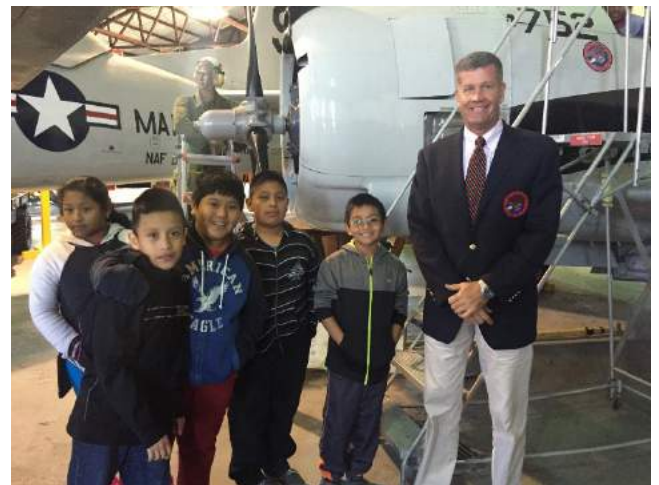
Class of 90 fourth grade students visit the Museum of Flight.