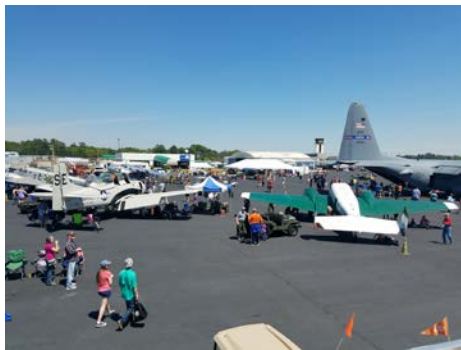
The air boss' view of the Museum of Flight's lay out.