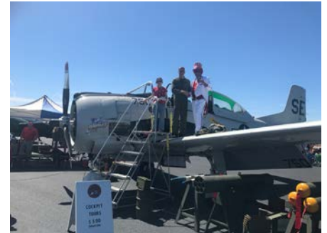
Captain USA with Peter O'Hare on the wing of the Museum of Flight's T-28.

April 8 th marked the beginning of the 20 th Thunder in the Valley airshow. It was an action packed weekend in Columbus. The museum had the T-28A, T-28B, and the C-45 available for the public not just to view, but to crawl into the cockpits of the massive planes. Other exhibits included the Big Air Insanity FreeStyle Motorcross Team, Chris Darnell and the Shockwave Jet Truck, and the U.S. Air Force F-16 and Red Tail Squadron P-51 to name a few. The airshow drew a big crowd and was the perfect opportunity for the museum to engage with the public.