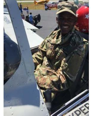
This young man has been away from home for almost a year.