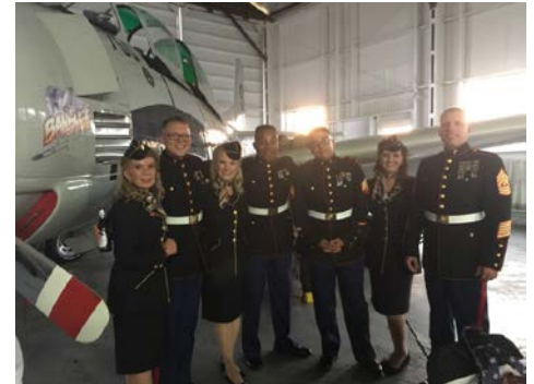
The Mike Battery Unit and Ladies for Liberty.

The Mike Battery Unit lost four of their own at the hands of a terrorist on our home soil just over two years ago. A table at the gala was dedicated to the five servicemen we lost. In an example of the Marine's unwavering loyalty to protecting the people and the Constitution four marines demonstrated the traditional color guard formation evoking a tremendous sense of gratitude in all observers. In another testament to the Unit's bravery, a 152-millimeter Howitzer Iraqi-owned gun was captured by the Mike Battery Unity was on display during the gala. The Mike Battery Unit reminded all attendees that the reason that the museum is able to exist is because of the servicemen and women that dedicated their lives to protecting us.