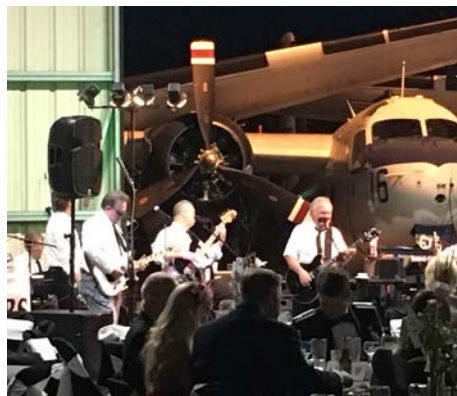
Dancing by THE BEATERS and DJ & sound by Matrix Music