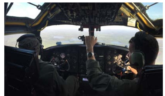
Returning the C-1 COD home after the gala.