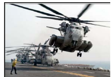
Marine CH-53 Helicopters – Shipboard Ops