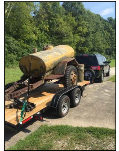
(Above) A 1943 USMC Water Buffalo used in WWII and Korea is on its way home to Rome, GA from Expeditionary Airfields.