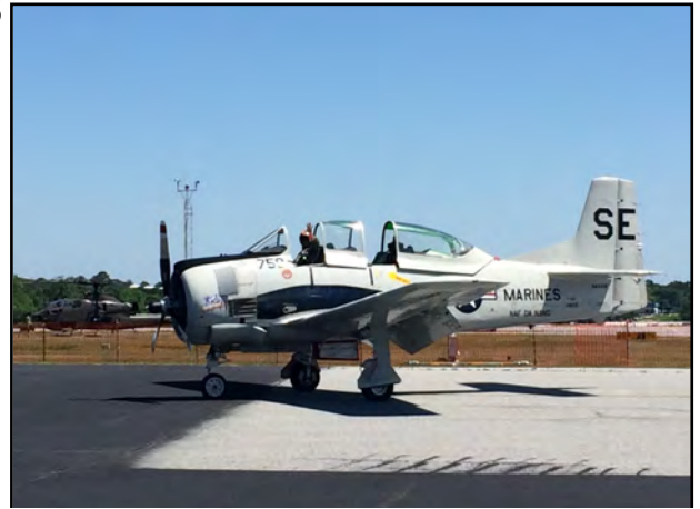
Pilot Pete “Wheeler” O’Hare waves for the camera.

The museum offered cockpit tours and a display of a variety of ammunition and other items used during the Vietnam War. Thunder in the Valley was great opportunity to share the museum’s love of aviation history with a variety of air show attendees. All who attended had a great weekend.